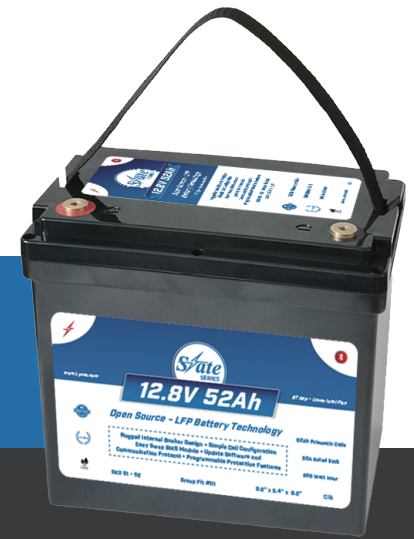
BT App - Lynac Intel Plus

52Ah Prismatic Cells . 50A Rated BMS . 665Wh Capacity . Bluetooth Monitoring with 'Lynac Intel Plus' App . IP65 Waterproof